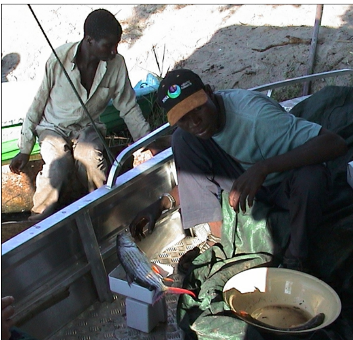
Lower right: Project personnel registering fish for sale in the Katima Mulilo fish market.