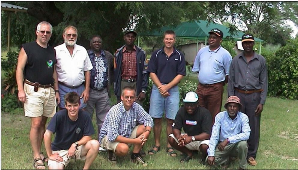
Upper left: Project team.